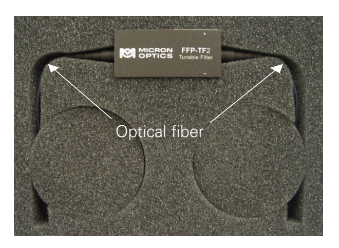
Figure 1 Tunable filter packed in special shipping case.

(1) Carefully unpack the filter from the special shipping case, taking extra care to avoid breaking the optical fiber (fig. 1). <u>NOTE</u>: the filter is shipped with a loose-tube jacket to provide added protection to the fiber pigtails. Pulling on the fiber while holding onto the jacket can break the fiber inside the filter enclosure and destroy the filter. Always wrap several coils of the pigtail around a 1-inch diameter mandrel to strain relief the fiber before stripping the buffer from the ends of the fiber.