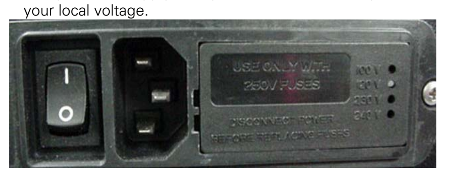
Figure 2. Power supply voltage selector, power cord connection, and on/off switch.

(b) Turn the SCAN AMPLITUDE and the SCAN FREQUENCY knobs fully counterclockwise.