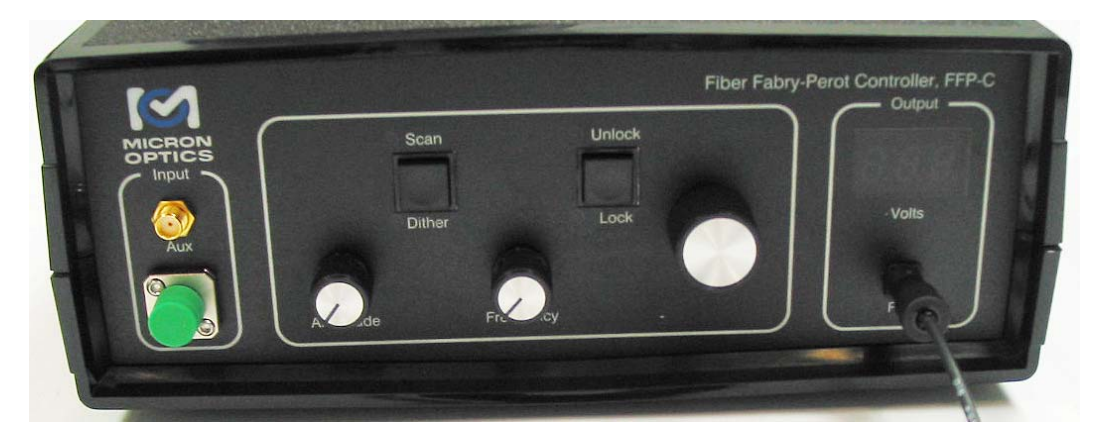
Figure 3. FFP-C front panel.