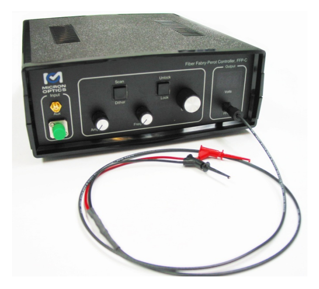
Figure 4. FFP-C controller.